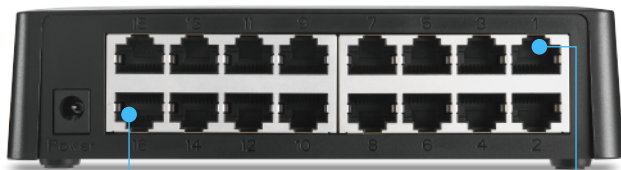
16x10/100Mbps RJ45 Ports (Connect to computer or notebook, etc)

compatibility and optimal performance. Featuring non-blocking switching architecture, the product forwards and filters packets at full wire-speed for maximum throughput. IEEE 802.3x flow control for Full Duplex mode and backpressure for Half Duplex mode offer increased bandwidth to alleviate network congestion. Finally, the AR-FS116 supports Energy Efficient Ethernet (EEE), which enables the switch to enter a power-saving mode when traffic is light, saving up to 75% of the power consumption.